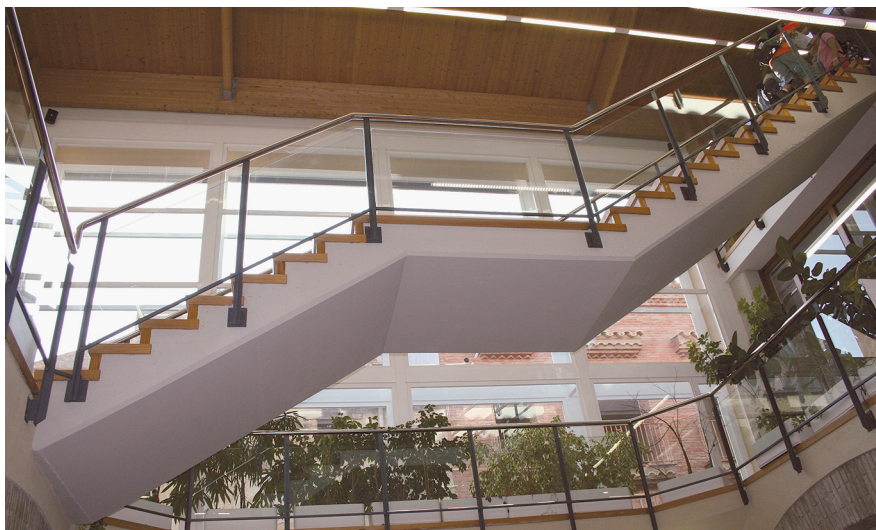
Fig. 7: Biblioteca La Cooperativa/La Cooperativa Library, Malgrat de Mar. Architect: Josep M a Romaní.