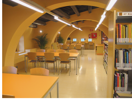
Fig. 4: Biblioteca El Castell/El Castell Library, Vacarisses. Architect: Xavier Guitart Tarrés, GAA SLP.