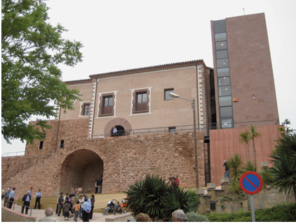
Fig. 3: Biblioteca El Castell/El Castell Library, Vacarisses. Architect: Xavier Guitart Tarrés, GAA SLP.

necessary to add a new extension to accommodate the entire library programme (Figures 3 and 4).