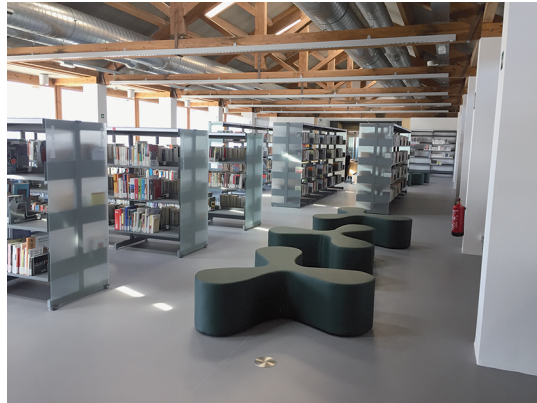
Fig 2: Biblioteca El Molí/El Molí Library, Molins de Rei. Architect: Antonio Montes.