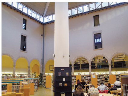
Fig. 10: Biblioteca Joan Triadú/ Joan Triadú Library, Vic. Architects: Bosch-Cuspinera Associats.

In buildings formerly operating as schools and hospitals, layouts using a central corridor with classrooms or dormitories on either side mean that large spaces can be liberated for alternative use. Conversely, a layout with a lateral corridor which is separated from the rooms by load-bearing walls offers only continuous spaces which are difficult to convert.