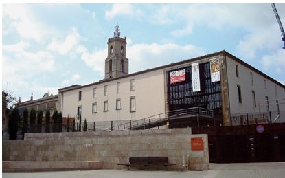
Fig. 18: Biblioteca Joan Triadú/ Joan Triadú Library, Vic. Architects: Bosch-Cuspinera Associats.