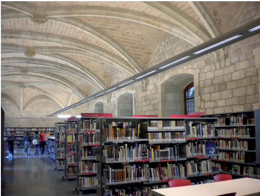
Fig. 8: Biblioteca Sant Pau-Santa Creu/Sant Pau-Santa Creu Library, Barcelona. Architect: ARQ FORUM S. L.

Buildings formerly functioning as schools, hospitals and convents are adaptable because they tend to be large and composed of spaces with diverse characteristics. They can be comparatively easily modified to suit the purposes of a library. The Biblioteca Sant Pau-Santa Creu/Sant Pau-Santa Creu Library in Barcelona ( https://bibliotecavirtual.diba.cat/es/barcelona-ciutat-vella-biblioteca-sant-pau-i-santa-creu ; https://bibliotecavirtual.diba.cat/documents/347084/0/BARCELONA+CIUTAT+VELLA-Biblioteca+Sant+Pau+i+Santa+Creu.pdf/95970a7d-e433-4620-b6de-40ddd51e870b ) occupies part of the former Hospital de la Santa Creu, one of the oldest hospitals in the world, which ceased to serve as a hospital in the early 20 th century. The facilities were reorganised and refurbished in 2010 to feature the building's splendid origins and today form a single public library with different sections to cater for all users (Figure 8).