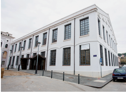
Fig. 13: Biblioteca Can Manyer/Can Manyer Library, Vilassar de Dalt. Architects: Xavier Fabré and Lluís Dilme.

ing, industry and art. The library's design and impact result from the way natural light is used with open façades and skylights (Figure 14).