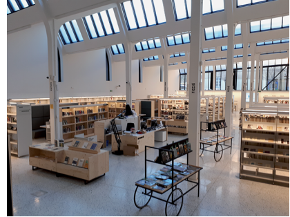
Fig. 14: Biblioteca Montserrat Abelló/ Montserrat Abelló Library, Barcelona. Architects: Ricard Mercader and Aurora Fernández.

The Biblioteca Central Tecla Sala/Tecla Sala Central Library in L'Hospitalet de Llobregat ( https://bibliotecavirtual.diba.cat/es/hospitalet-de-llobregat-l-biblioteca-tecla-sala ; https://bibliotecavirtual.diba.cat/documents/348151/0/L%C2%B4HOSPITALET+DE+LLOBREGAT-Biblioteca+Tecla+Sala.pdf/72872342-9be8-449a-aac7-c09ff3cf1199 ) occupies a former textile factory that was renovated to house a cultural centre comprising a public library and a museum of identical dimensions. Since both organisations wanted the best location inside the building, the architect opted for a Solomonesque solution, coming up with the idea of an exterior ramp to locate the entrance adjacent to both facilities in the geometric centre of the building. From there, the museum occupies half of the first floor and all the ground floor, while the library occupies the other half of the first floor and all the second floor (Figures 15 and 16).