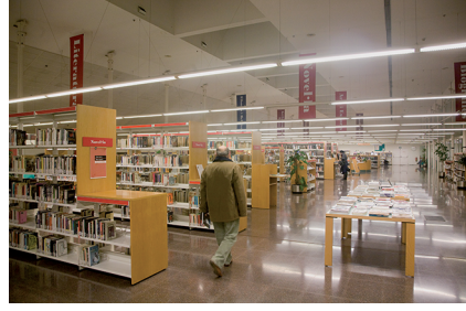
Fig. 16: Biblioteca Central Tecla Sala/Tecla Sala Central Library, L'Hospitalet de Llobregat. Architect: Albert Viaplana.