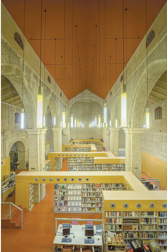
Fig. 17: Centro de Documentación de las Artes Escénicas de Andalucía/ Andalusia Performing Arts Documentation Centre, Sevilla. Architect: Miguel Bretones del Pozo (SSW Arquitectos).