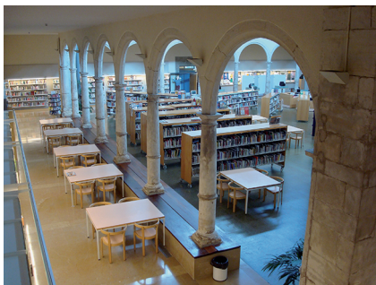
Fig. 9: Biblioteca Joan Triadú/ Joan Triadú Library, Vic. Architects: Bosch-Cuspinera Associats.

jects reusing the buildings for libraries. The public library Biblioteca Joan Triadú/ Joan Triadú Library in Vic ( https://bibliotecavirtual.diba.cat/es/vic-biblioteca-joan-triadu ; https://bibliotecavirtual.diba.cat/documents/351872/0/VIC-Biblioteca+Joan+Triad%C3%BA.pdf/8287a430-575d-4f0b-adc0-f164813898e1 ) occupies the cloister and one half of the former Convent del Carme, capitalizing on the light available, with the remainder of the building occupied by a museum (Figures 9 and 10).