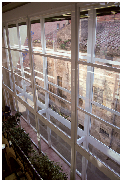
Figs. 5 and 6: Biblioteca La Cooperativa/La Cooperativa Library, Malgrat de Mar. Architect: Josep M a Romaní.